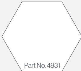
Part No. 4931

Gloss White/Black Back THB, 6,35 mm x 203 mm x 203 mm, R 3,175 mm, 12/case