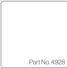
Part No. 4928